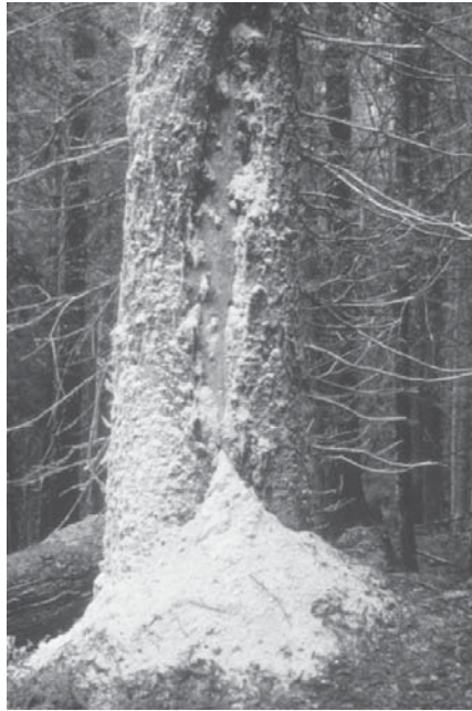
Sawdust at the base of a tree can be an indication of carpenter ants.

Since treated wood is less likely to have decay because the preservatives inhibit decay fungi, the treatments may indirectly reduce carpenter ant damage. However, carpenter ants do not eat wood, therefore various wood preservatives will not stop carpenter ant damage. Damage from carpenter ants develops as a result of their excavation of wood.