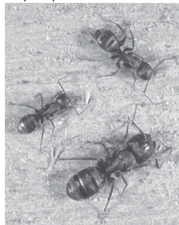
The size of carpenter ants can vary

Carpenter ants are fairly secretive and do the majority of their foraging at night or via a series of underground tunnels. Typically the ants will follow a network of well-traveled trails.