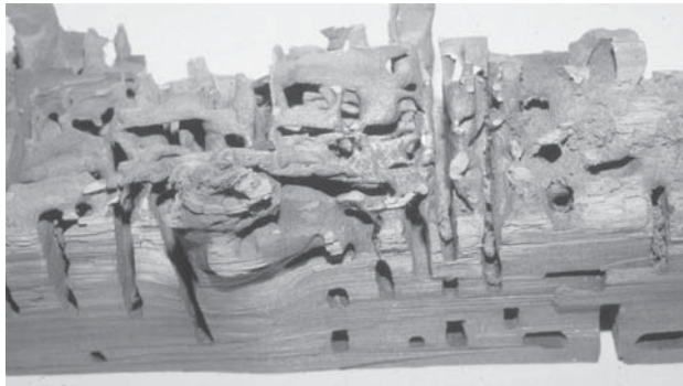
Wood riddled with holes from carpenter ants

Therefore, the presence of a few ants is adequate to suggest a tree is infested, or it may mean that an infestation is nearby and workers are using that tree as part of their trail network.