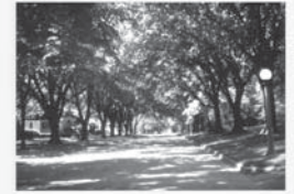
Recommended Urban Trees: Site Assessment and Tree Selection for Stress Tolerance

This publication is also available electronically at: www.hort.cornell.edu/uhi/outreach/recurbtree/index.html